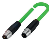
Fieldbus cable for networking the IO-Link master with the PLC or other fieldbus slaves