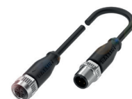
Three-conductor cable for connecting IO-Link sensors

The IO-Link master is available for all common fieldbuses. It includes a power output as well as fieldbus input and output. Depending on the application, different numbers of ports are also available.