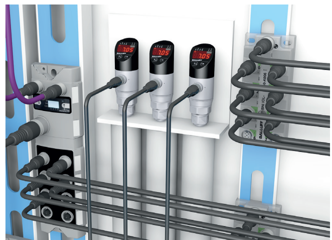
Connecting an IO-Link master to IO-Link sensor/actuator hubs and IO-Link pressure sensors

These signals are transported within a machine (between sensors/actuators/ and the PLC) or across the plant (between different PLCs) via fieldbuses. These enable, among other things, communication over large distances.