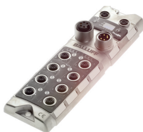
IO-Link master in metal for decentralized use

A large number of different fieldbuses have become established over time. Since IO-Link is fieldbus-neutral, the device level with IO-Link remains unchanged regardless of which fieldbus you are using.