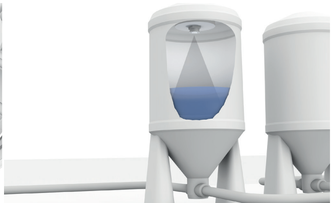
Ultrasonic sensors check the fill height of tanks.

Capacitive sensors reliably detect the level of granulate in a container. To accomplish this two sensors are attached in the container offset from each other. A signal is generated when the minimum or maximum level is exceeded. This prevents over-filling or falling of the level below a prescribed value, and reduces equipment downtime. Capacitive sensors are flexibly designed and simple to install.