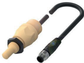
Capacitive sensor for detecting levels – with or without medium contact – at close range

Ultrasonic sensors detect the precise fill height of a tank without contact. They ensure that the filling process can run continuously. Ultrasonic sensors are also reliable over greater distances and require no additional component such as reflectors.