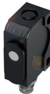
Ultrasonic sensor for detecting levels – without contact – even over longer distances

Various technologies can be used for detecting level depending on the application area: