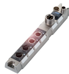
4-port IO-Link master with Profibus interface

With IO-Link-based automated identification you only need three components: