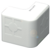
Corner data carriers for workpiece carriers in the fields of assembly and handling, with up to 2kB memory

A RFID read/write head reads the corner data carrier which can be read from two sides. Both products are especially designed for mounting on standardized workpiece carrier systems and standardized rail systems. Simply connect the RFID read/write head to the IO-Link master unit, which you can then connect up to four IO-Link devices. Using Profibus, the data is made available to the host controller. If you have little space available, a small read/write head with separate controller unit is ideal.