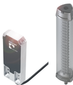
Read/write head and stack light with IO-Link interface