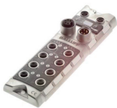
Ethercat fieldbus block in metal housing for field use (8 slots)

The advantage of these fieldbuses is not only in the communication over great distances, but also in the diagnostic function. In addition, signal transmission with a fieldbus requires fewer wires than signal transmission using a junction block.