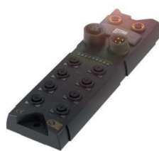
Fiberglass reinforced Ethernet/IP fieldbus block for especially harsh environments (8 slots)