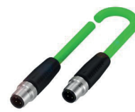
Fieldbus cable for connecting the fieldbus block to the controller

There is a variety of different fieldbus blocks: