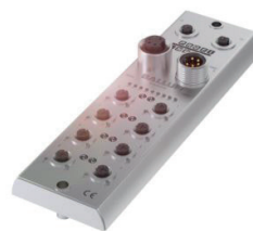
Profinet fieldbus block in stainless steel for hygienic areas (8 slots)