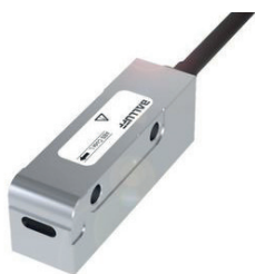
Magnetic encoder, ideally suited for linear drives with its extraordinarily high accuracy.

In a machine tool the clamping state of a spindle must be continuously monitored during machining. This improves results on the workpiece and increases the reliability of the overall system. Inductive positioning systems provide continuous feedback to the controller: whether the spindle is unclamped, clamped with a tool or clamped without a tool.