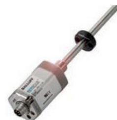
Magnetostrictive linear position sensor for high accuracy, making it ideal for use in hydraulic cylinders

The following sensor technologies are ideal for linear position measurement: