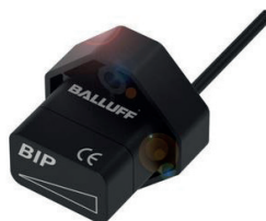
Inductive positioning system: its repeat accuracy and linearity make it ideal for applications such as clamp monitoring.