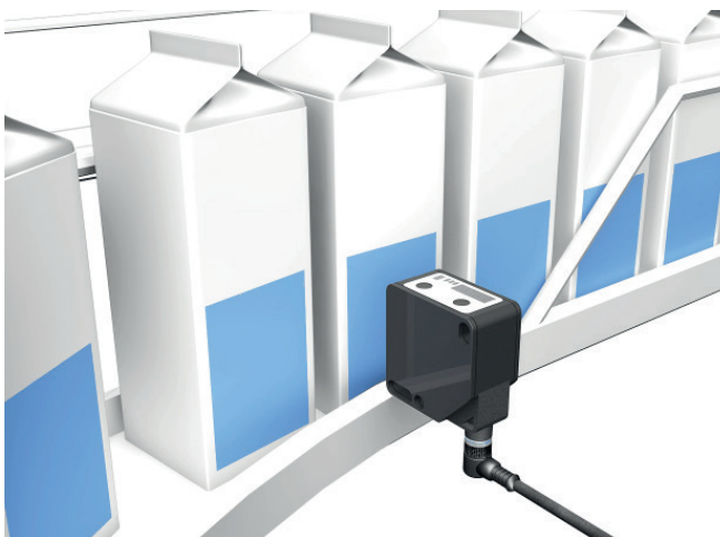
Reliable detection of colored labels with the IO-Link color sensor

Thanks to the expanded possibilities IO-Link-capable sensors offer you in installation, diagnostics and configuring, the industrial, automated detection of objects has been raised to a new level of quality. And you will soon be able to connect binary standard sensors to the controller easily through IO-Link sensor/actuator hubs.