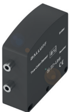
IO-Link capable intelligent color sensor

The signals from binary switching sensors can be condensed using sensor/actuator hubs and sent to the controller over IO-Link. You benefit from decentralized installation and significantly reduced control cabinet volume. Assembled standard cables are all that are needed.