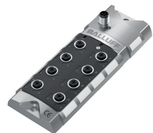
Sensor/actuator hub for connecting binary and/or analog sensors and actuators

A variety of IO-Link capable binary sensors are available for object detection: