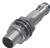
Teachable inductive sensor with IO-Link and adjustable switching distance