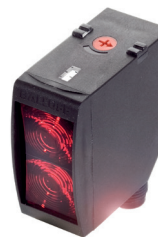
Photoelectric sensor with adjustable background suppression over IO-Link