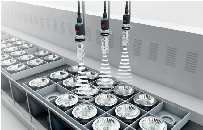
Parts are checked for presence, location and completeness during transport.

There are many ways in automation to detect, collect and position objects. You can use magnetic fields, permittivity – a material property –, light and sound to detect metals, non-metals, magnets, solids and liquids without contact. And you can do it over distances from 1 mm up to 60 m.