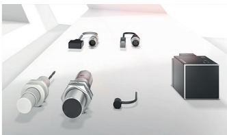
Inductive sensors will detect any metallic object.

You can reliably detect and inspect parts during transport with the help of suitable sensors. Even under difficult conditions. Depending on the requirement you select inductive, photoelectric, capacitive or ultrasonic sensors. Photoelectric and ultrasonic sensors are usually used to detect objects located at greater distances (> 50 mm). Inductive or capacitive sensors are best suited for objects at a closer distance from the sensor (< 50 mm).