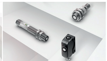
Ultrasonic sensors use sound to detect virtually any object regardless of color or composition.

Various technologies can be used depending on the application area: