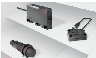
Capacitive sensors detect the presence or level of virtually any material or liquid.